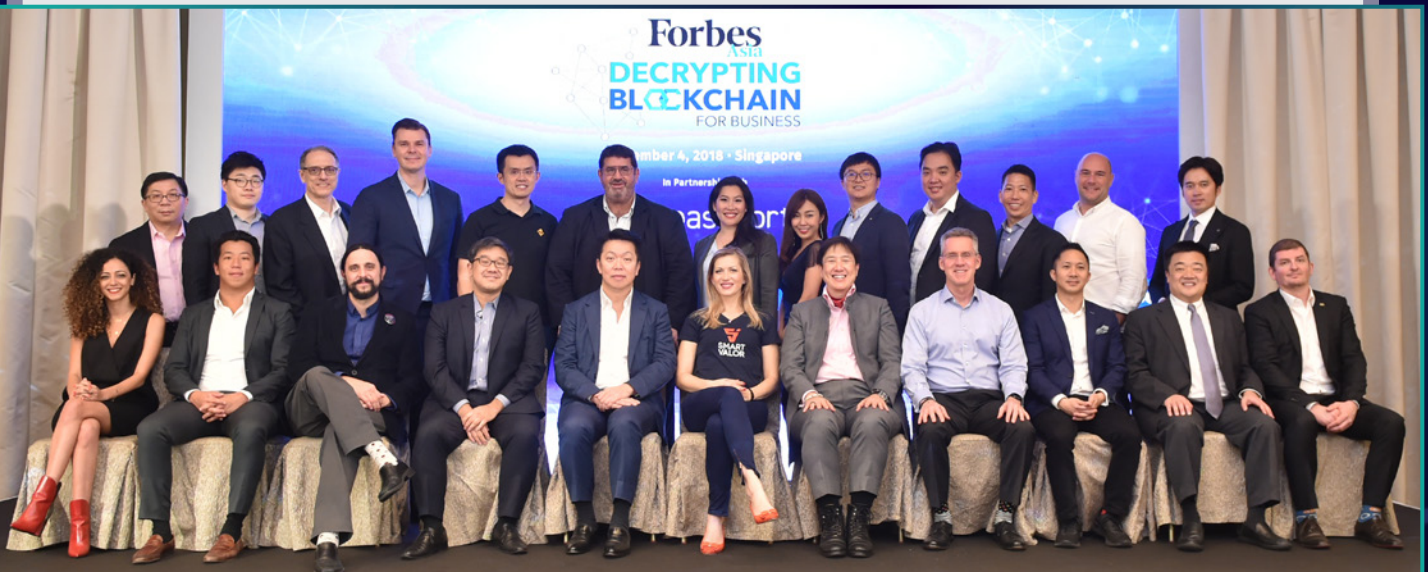
Speakers at the Forbes Asia Forum: Decrypting Blockchain for Business .